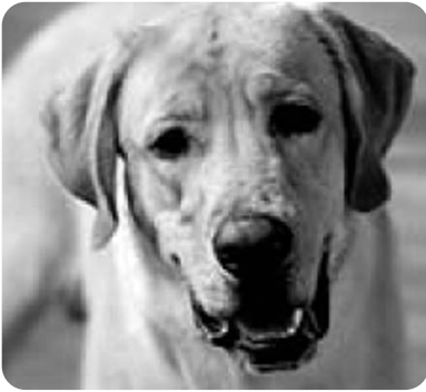
Cooper: Available for Adoption

A FREE PUBLICATION FROM ANIMAL OUTREACH, INC. • WINTER 08-09