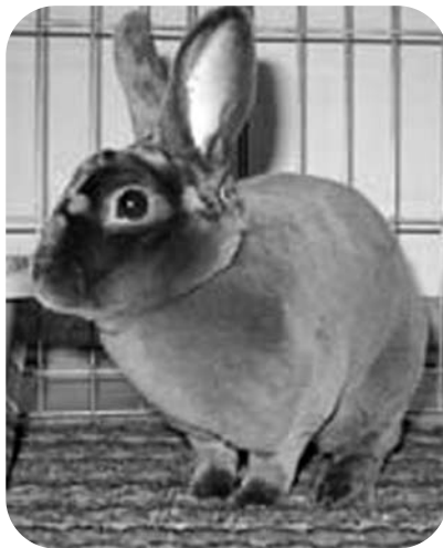
Earl... Looking for love!